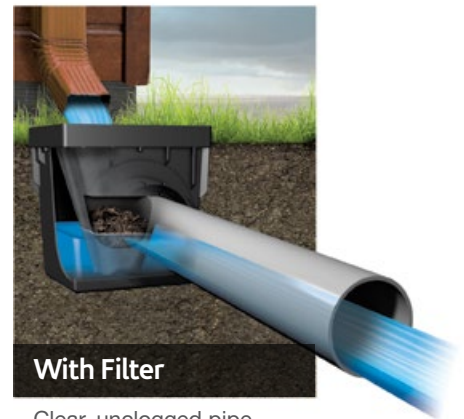
Clear, unclogged pipe